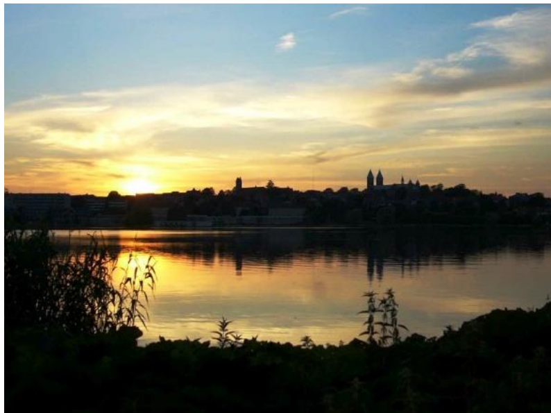
Sct. Mogensgade Viborg

The code above in parentheses shows the meals that are included (Breakfast/Lunch/Dinner), (-) is not included.